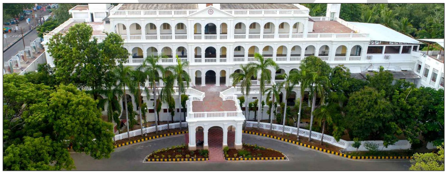
St. Joseph's College (Autonomous), Trichy

An approach towards integral engagement in higher education for being learner-centric to create empowered minds spans across a diverse range of values, philosophies and ideologies. Common areas of thrust may be mutuality,