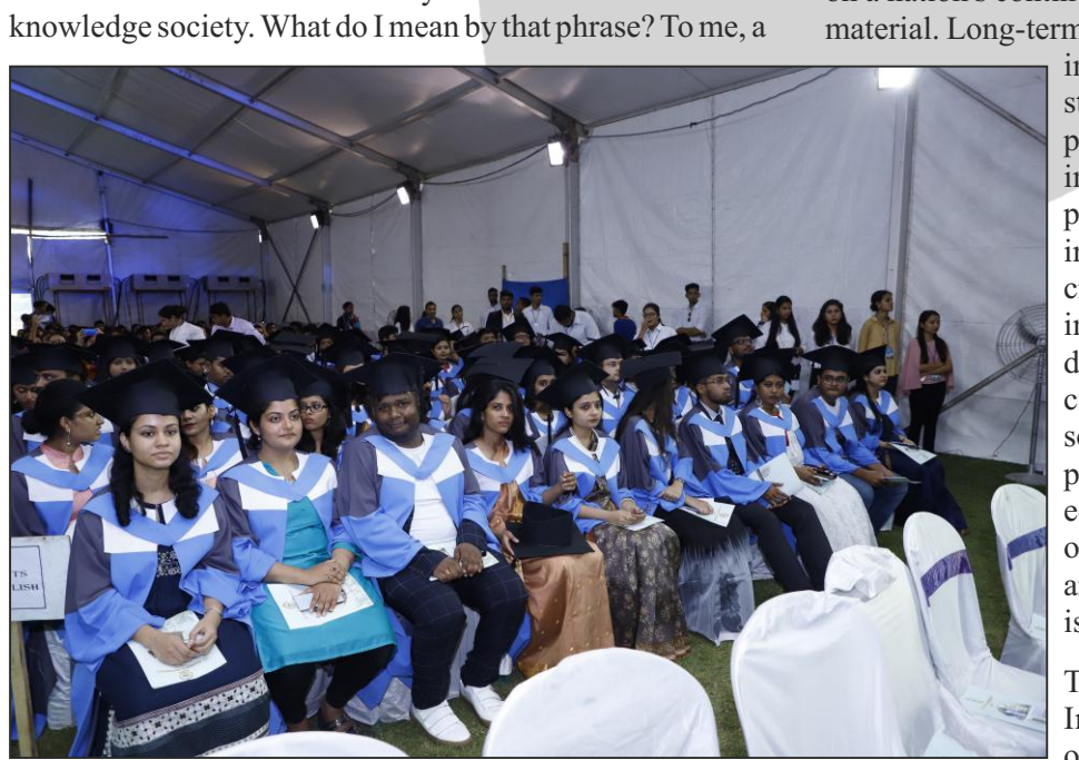
Convocation Ceremony at the St. Xavier's University, Kolkata

Our vision for the 21st century must be to make India a