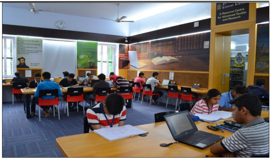
Central Library at St. Xavier's College (Autonomous), Kolkata

knowledge society is one that is capable of both creating theoretical knowledge of global significance and then materially benefitting from it; a society where the pursuit of learning and innovation should not be constrained by any lack of access, infrastructure or support; where education is relevant to society, and provides the skills and competencies that society demands. We must understand clearly that we are talking of a knowledge society—one that is committed to excellence as an end in itself-and not just creating a knowledge economy.