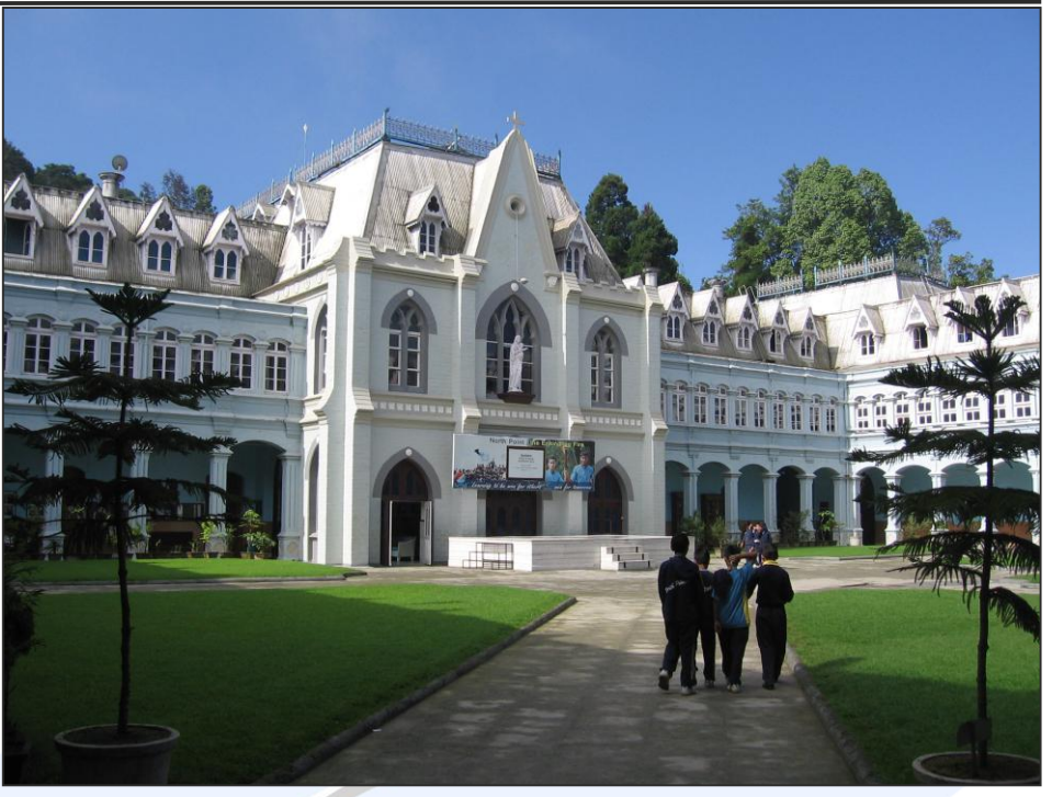
St. Joseph College (North-Point), Darjeeling

True to say, the academic community in Jesuit universities and institutions are the chosen ones to be Lay Jesuits to enjoy a comfortable seat and a pleasurable work-time towards complete commitment and total engagement on campus for nurturing young minds for a better tomorrow. In line with the same, higher education, to be a sustained drive towards the motive of creating global citizens and empowered minds, all intuitions and universities need to therefore somewhat benchmark practices and prioritize their plans and procedures