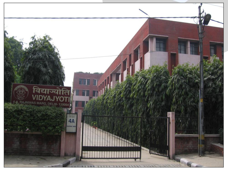
Vidyajyoti College of Theology, Delhi

Precisely, Vidyajyoti aims at developing a contextual method of doing theology (higher education). As integral part of its curriculum, each student is assigned to a concrete social context and is initiated into the socio-cultural analysis of the Indian situation. This enables the students to get a more competent and comprehensive grasp of the issues (sociocultural, politico-economic, and personal-societal) that affect the lives of ordinary Indians, especially the poorest of the poor. Theological reflection is thus closely related to the questions emerging from the context thereby equipping each student to understand the Christian faith (various faiths) within the Indian (global) context and in dialogue with India's many religions.