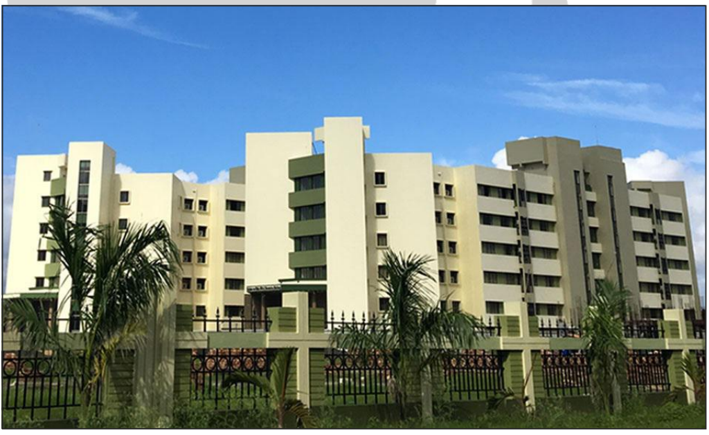
St. Xavier's University, Kolkata

Now in 2019, when I reminisce my days as a young graduate, I think of how few the options available to us in our college