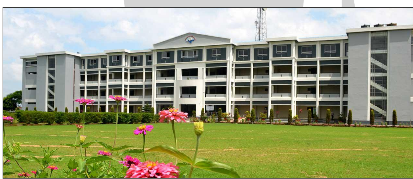
St. Xavier's College, North Bengal