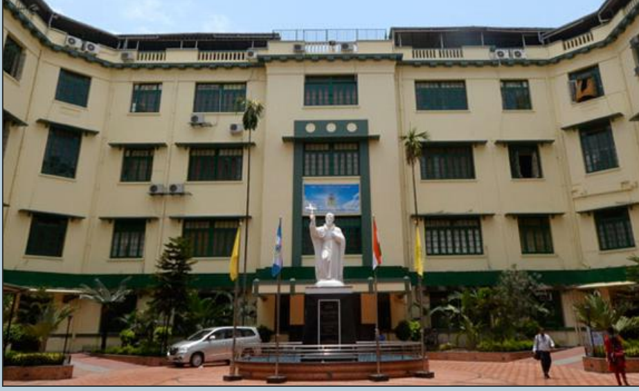
St. Xavier's College (Autonomous), Kolkata

Universities and Colleges by their origin, nature and mandate are communities of masters and scholars of diverse cultures, pursuing a variety of disciplines of thought, but all seeking relentlessly to decipher the secrets of creation, both empirical and meta-empirical, and placing them at the service of human flourishing. Universities represent the world community. These are the ideal nurseries to form global citizens that the world needs today than ever before.